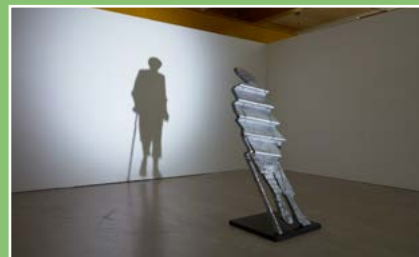
Jon Raine, Cast Shadow - The Elderly

An installation-opera featuring correspondence, drama, film scripts, poetry, diaries, and other historical data to unfold a free-form account of European history: a view across a desert strewn with half-exposed fragments and ruins.