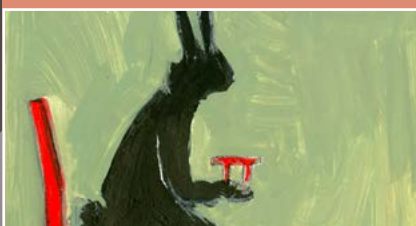
Bella Kerr, Bed and Table, Rabbit