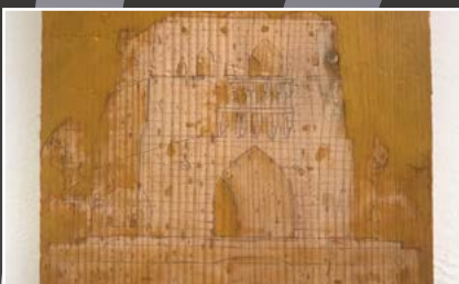
Archie Rogers, Danaik Watchtower

We invite you to come and explore this feast of various Artists' creations. Expect the strange and wonderful! What will you discover at The Circus of Curiosities?