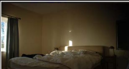
Ed Haskew, Untitled