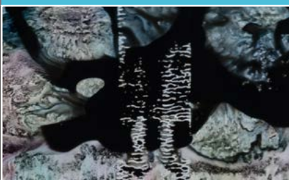
Loïc Kreyden, Current State of Waves

For info on walks and venue access visit fringeartsbath.co.uk/wonder before visiting