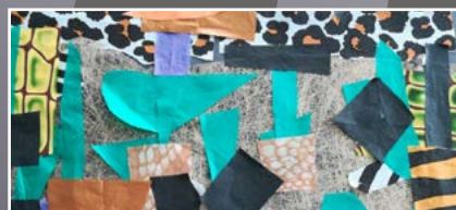
Fresh Art @ Participant, Work in Progress - Collage

Celebrating great live musical moments, captured by members of the legendary Bell Inn Pub's community over the years.